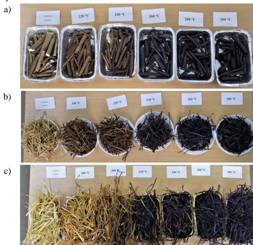
Fig. 2. Change in the colour of biomass depending on the temperature of torrefaction: a – Jerusalem artichoke, b – soybean (chaff), c – barley (straw)

In addition, as a result of the research, some pattern of colour change of biomass, which is subjected to thermal treatment was noticed. The colour of the feedstock is an intuitive indicator that changes when the feedstock is thermally degraded [31]. The colour change of biomass depends on the conditions of torrefaction. It has been found that the colour change of biomass from brown to black occurs at the temperature range of 150-300 °C [32]. This primarily results from the changes in the chemical composition after torrefaction. The colour range of samples prepared at different temperatures also has its own characteristics. In most cases, there were two characteristic changes in colour. At low temperatures, characteristic mainly for the first stage of thermal treatment (Fig. 2), there is a slight change in colour towards darkening, or there is a characteristic shade. At temperatures, corresponding to the beginning of a sharp increase in the weight loss, brown-black tones appear in the samples, until they acquire a charcoal colour (Fig. 3). Since these changes correspond quite accurately to the stages described above on the curves of the weight loss, we can conclude that colour is another promising area for determining the parameters of thermal treatment of biomass.