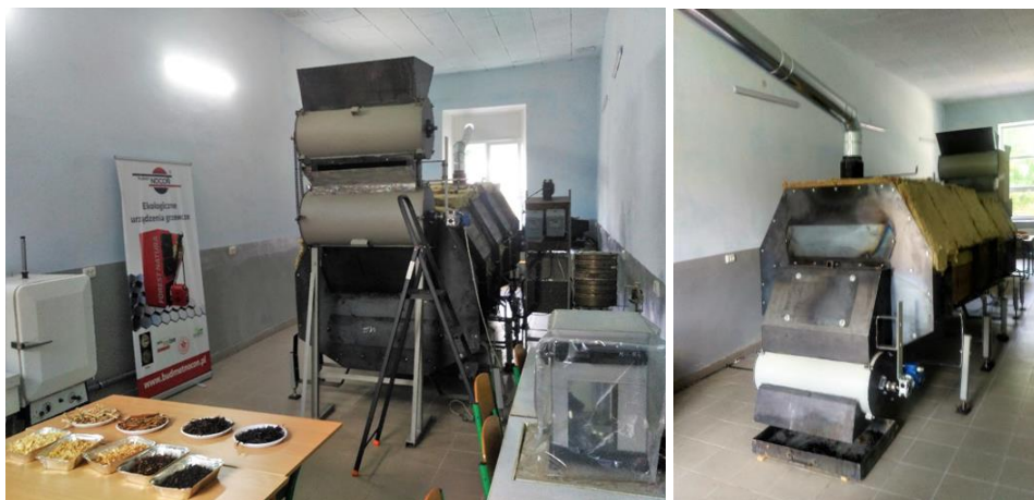
Fig. 1. General view of the biomass torrefaction installation (in laboratory “DAK GPS”)

It continues the work on the scientific topic “Agrobiomass of Ukraine as an energy potential of Central and Eastern Europe” (registration number 0119U103056) at the State Agrarian and Engineering University in Podilia, the joint Ukrainian-Polish educational and scientific laboratory “DAK GPS” [23-27]. The main activity of the laboratory is to improve the energy performance of biomass by thermal treatment (torrefaction), which results in torrefied product. Investigations of the primary signs of the state of heat-treated raw materials were carried out on a plant for torrefaction of tape-type biomass with passive interaction with the material (Fig.1). This method minimizes the physical and mechanical effects on the raw material, and the flow of the process allows to get the most homogeneously processed product. Control automatics allow to adjust and maintain the temperature in the thermal chamber, as well as the speed of movement of the tape, which determines the residence time of the biomass under the influence of thermal action.